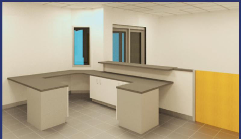
Front office doors and reception desk - view from inside office