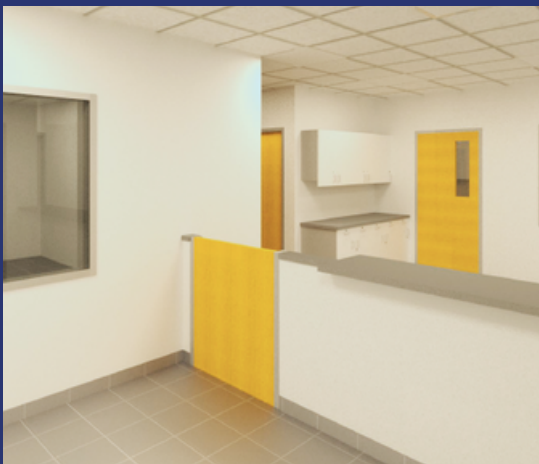
Front office - view from main entrance